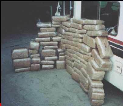
Over 1000 lbs. of marijuana seized by an officer who uses the techniques.

Special Requirements: A thirst for gaining an insight on properly doing Criminal Interdiction arrests.